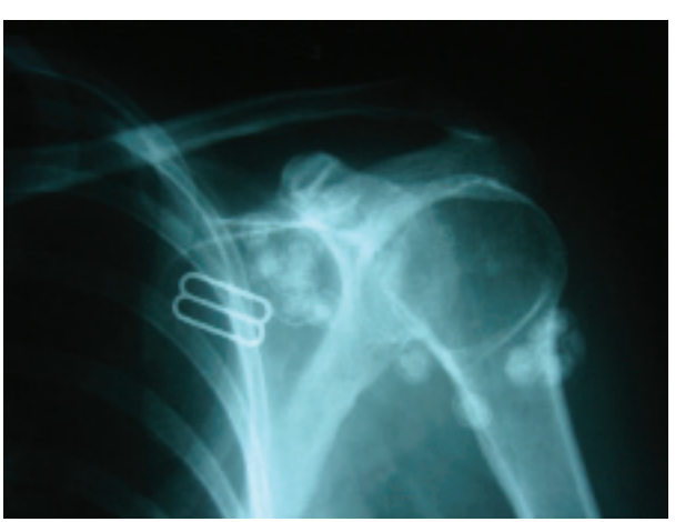
Figure 4. Increased size and number of cartilaginous nodules in the joint and minimal or moderate chondral damage were seen in a four-year follow-up X-ray.

years of follow-up, no sign of malignancy was observed. The literature provides no information about the incidence of malignancy between conservative and surgical treatments. According to Milgram, synovial chondromatosis is a self-limited process which runs over several years from onset to resolution. He believes that the resorption of intrasynovial nodules is as common as proliferation (4). Swan and Owens reported spontaneous regression for synovial chondromatosis (8). In spite of spontaneous regression, we observed that the size and number of cartilaginous nodules have increased for four years in our case.